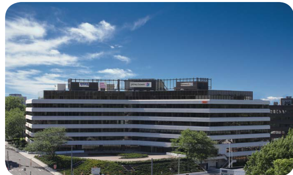
3001 STAMFORD SQUARE STAMFORD, CT – 290,000 SQ. FT.