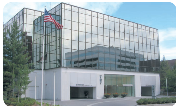
707 SUMMER STREET STAMFORD, CT – 74,000 SQ. FT.